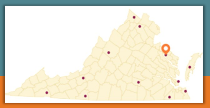
Eastern Virginia Agricultural Research and Extension Center (AREC)

2229 Menokin Road Warsaw, VA 22572 Phone: 804-333-3485 jcoakes@vt.edu