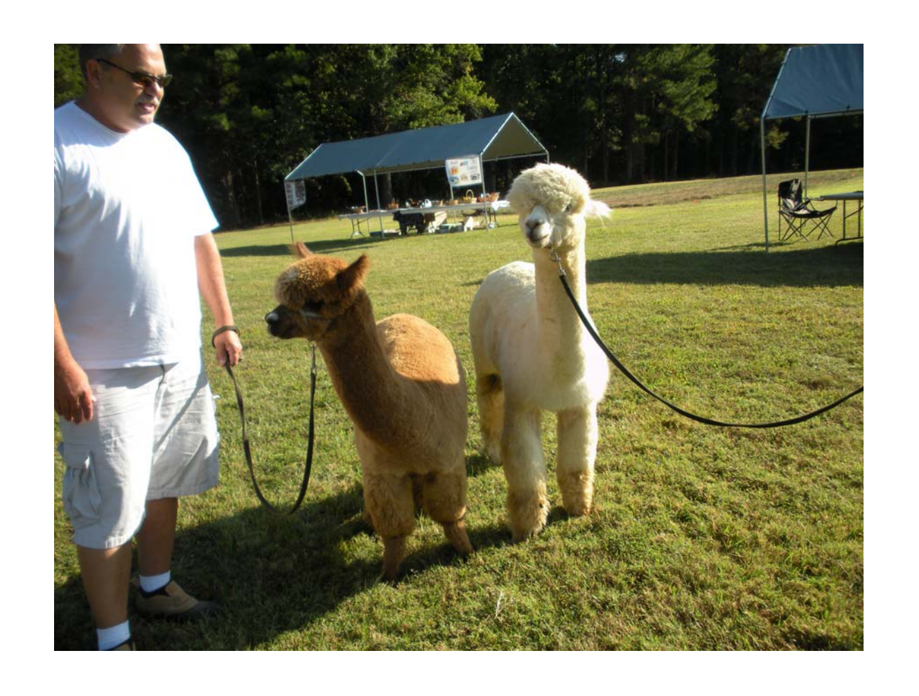
Clearview Farm Alpacas