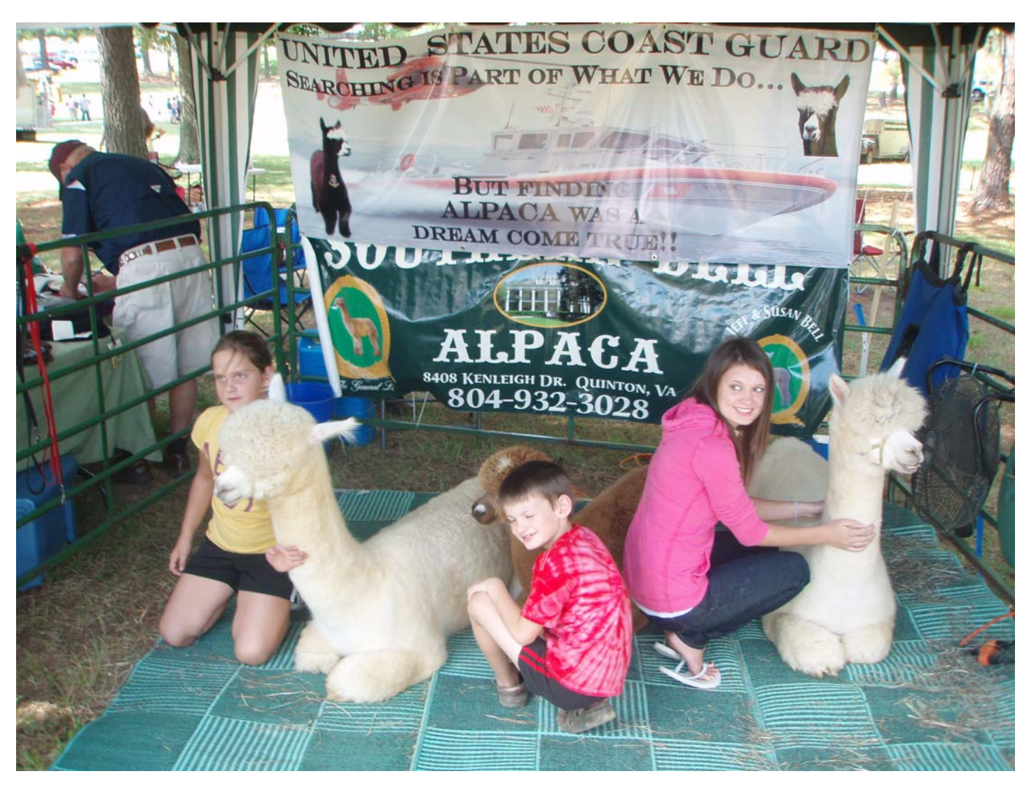
Family and Farm Day 2009