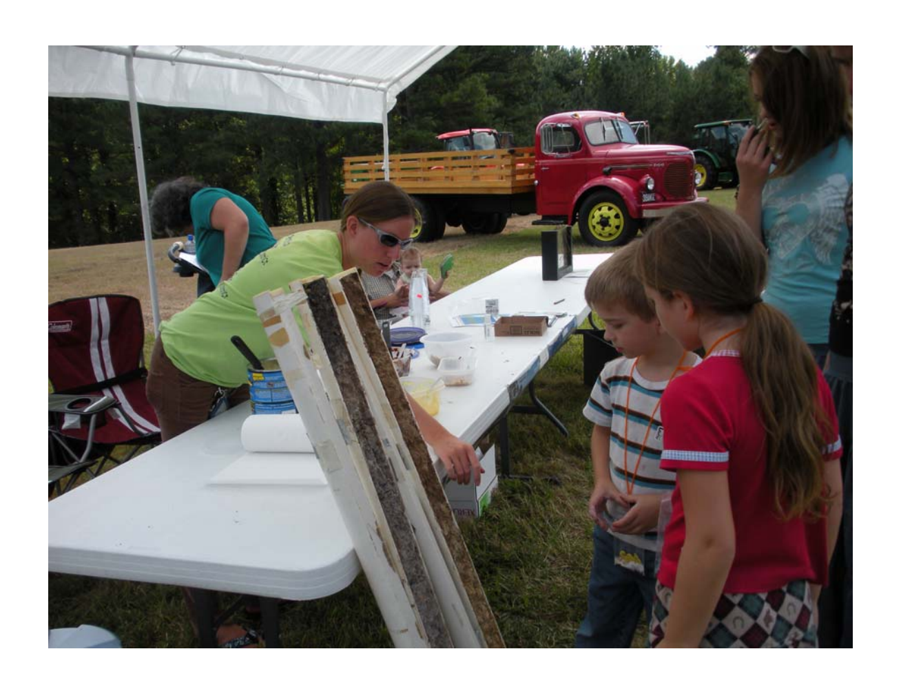
SWCD - Soils