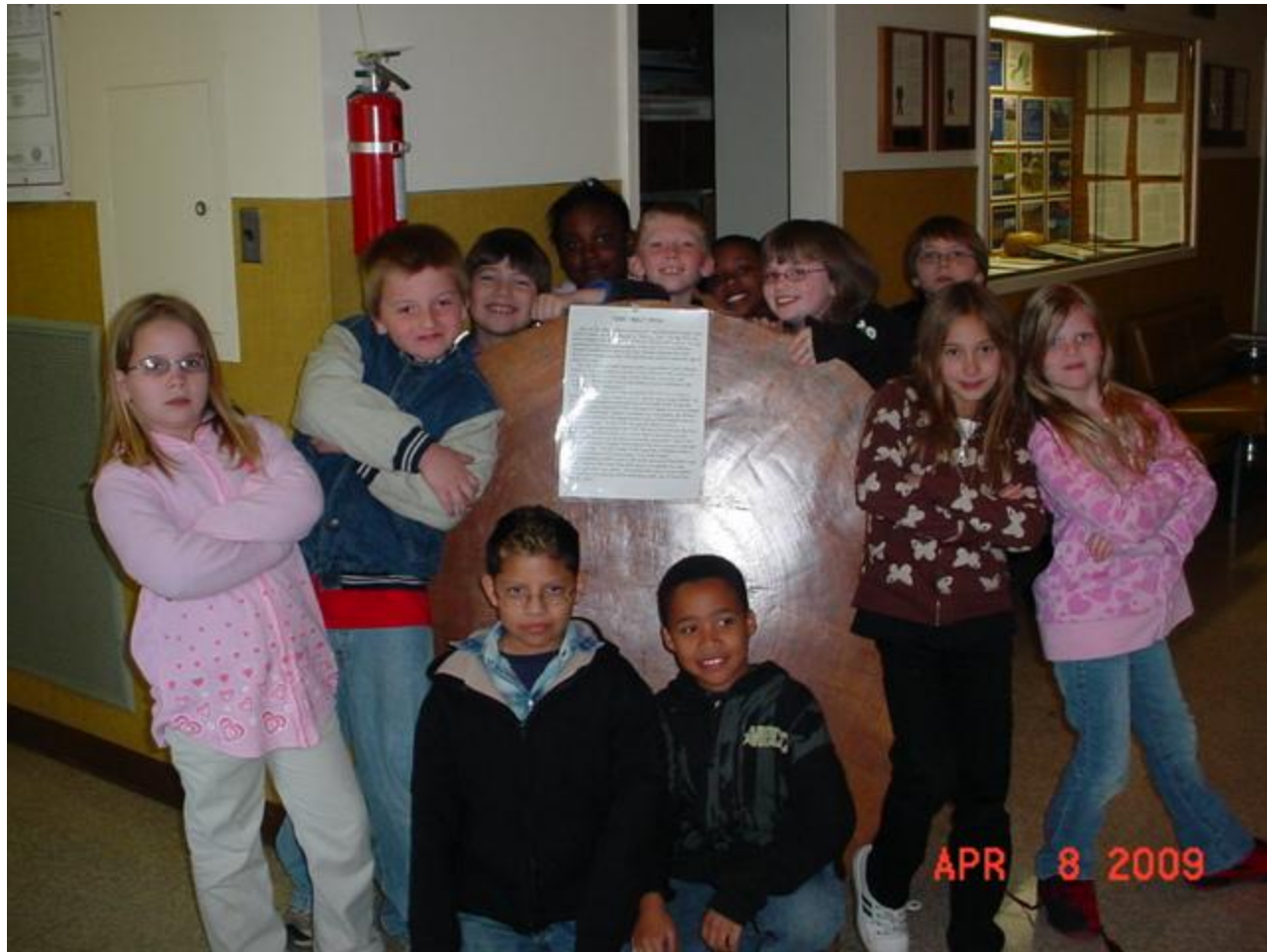
The Big Pine – a slice from the largest Loblolly Pine on earth is on display at the Research Station in Blackstone