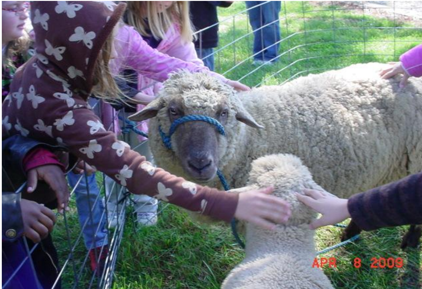
“Baby Girl” loved all the attention. The children could feel the lanolin (oil found in sheep wool) on their hands after petting her.