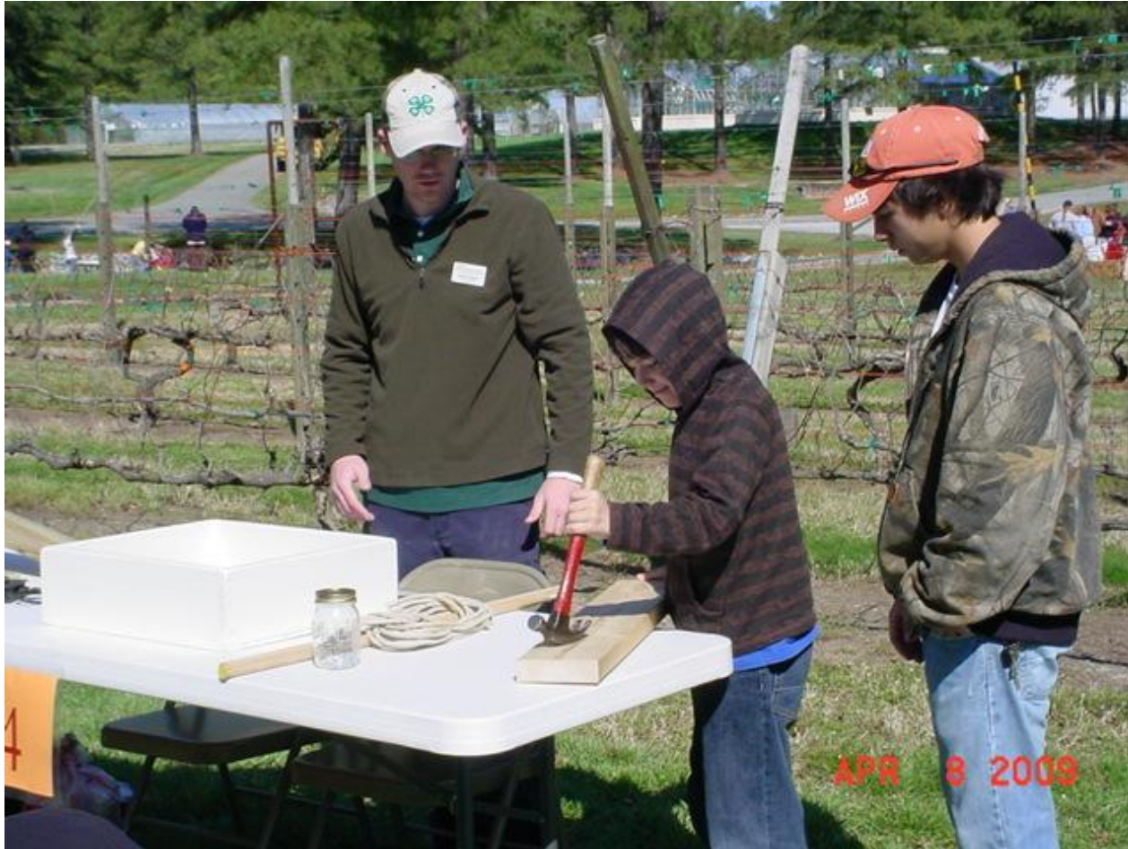
Simple Machines - Lever