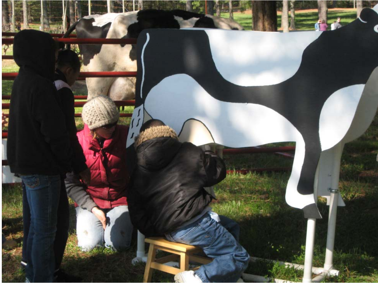
Students had the opportunity to milk the “no-kick-cow”