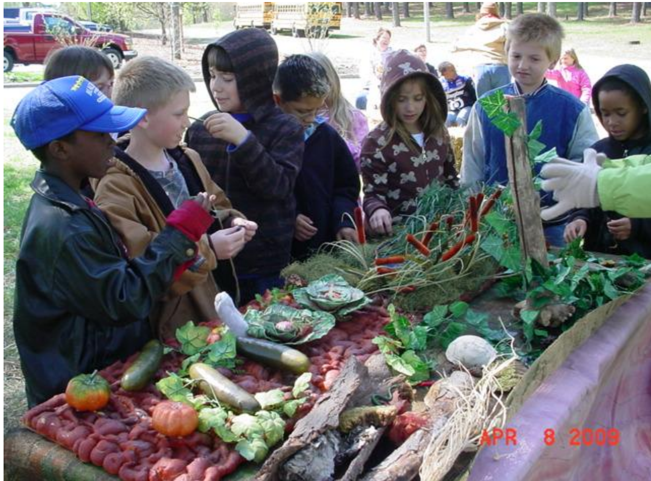
Soil Tunnel - Some of the many things grown and found in soil. Students were able to crawl under this table and see soil from below the surface.