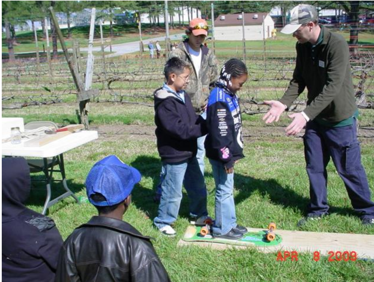
Simple Machines – Wheel and Axle