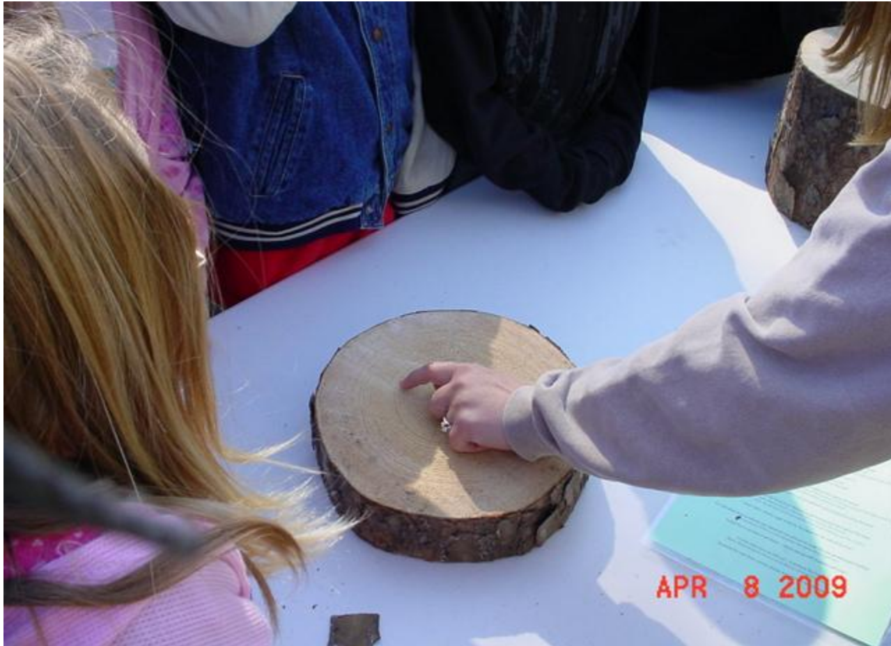
Forestry - Identifying the different layers of a tree and the job each layer does