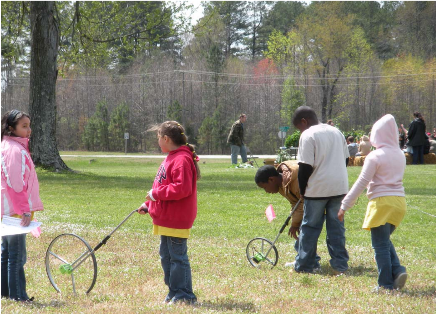
Forestry Station – using different tools the children were asked to measure an acre