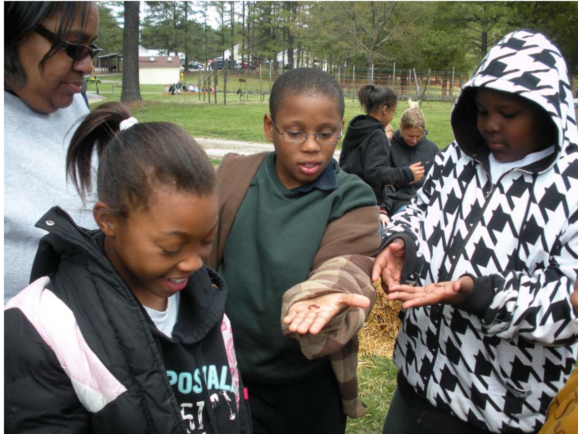
Mrs. Wilson's Third Grade Class – holding some red wigglers used to compost kitchen scraps and turn it into nutrient rich soil with “vermicomposting”