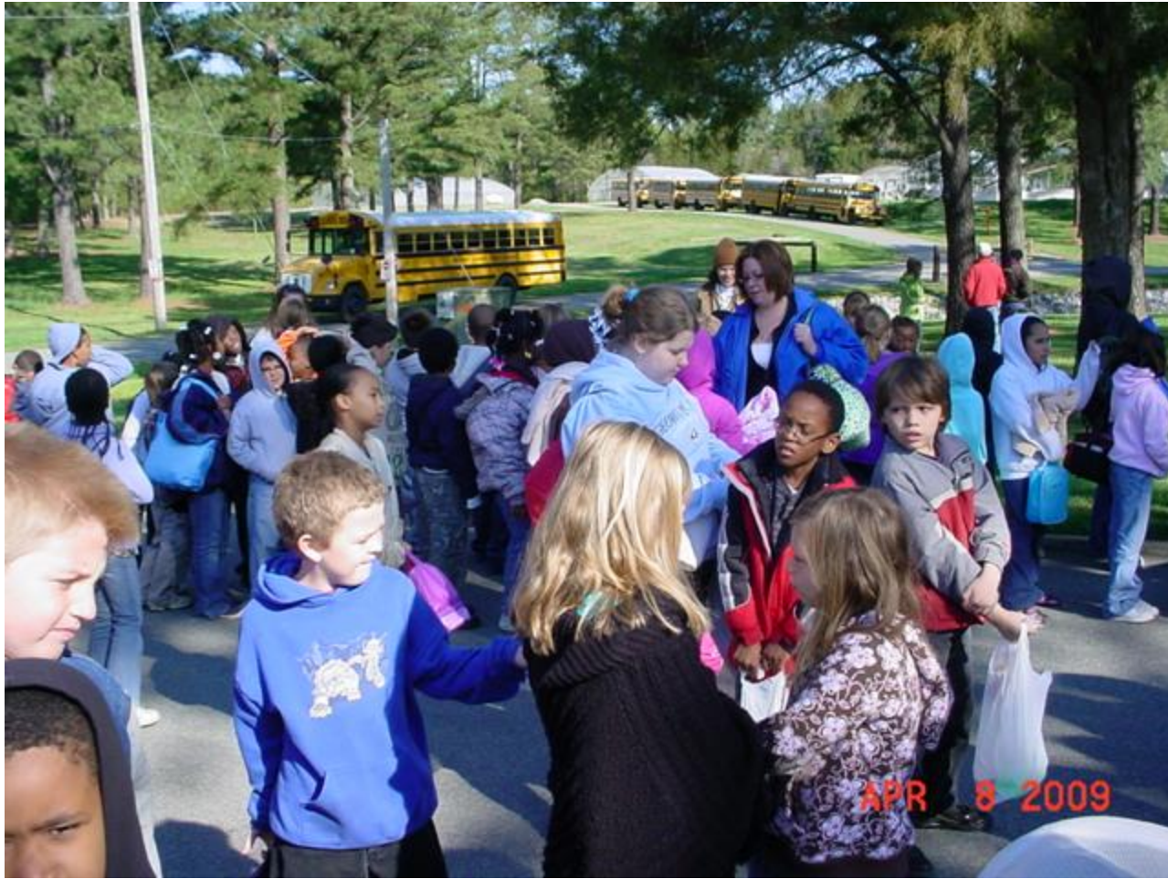
Third Grade Children Arrive