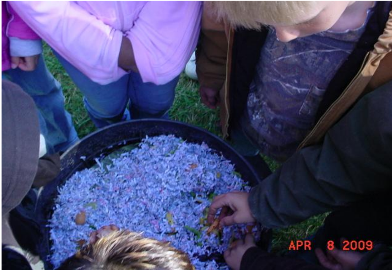
Compost Bin- Filled with damp paper and food scraps for worms to eat and turn into compost