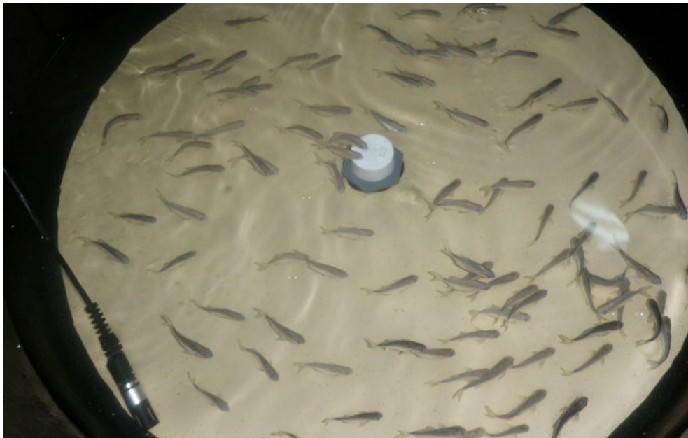
View of pompano juveniles in an experimental tank.

Regarding their fatty acid profile, all tissues analyzed were affected by dietary treatments, and generally imitated dietary fatty acid composition, which is highly consistent with the pertinent literature on fish oil sparing. All experimental diets tested produced fillets with reduced levels of beneficial omega-3 fatty acids and LC-PUFAs vs. the FISH control group. None of the diets produced the same fillet levels of omega-3 fatty acids or omega-3:omega-6 fatty acid ratio as the FISH control feed.