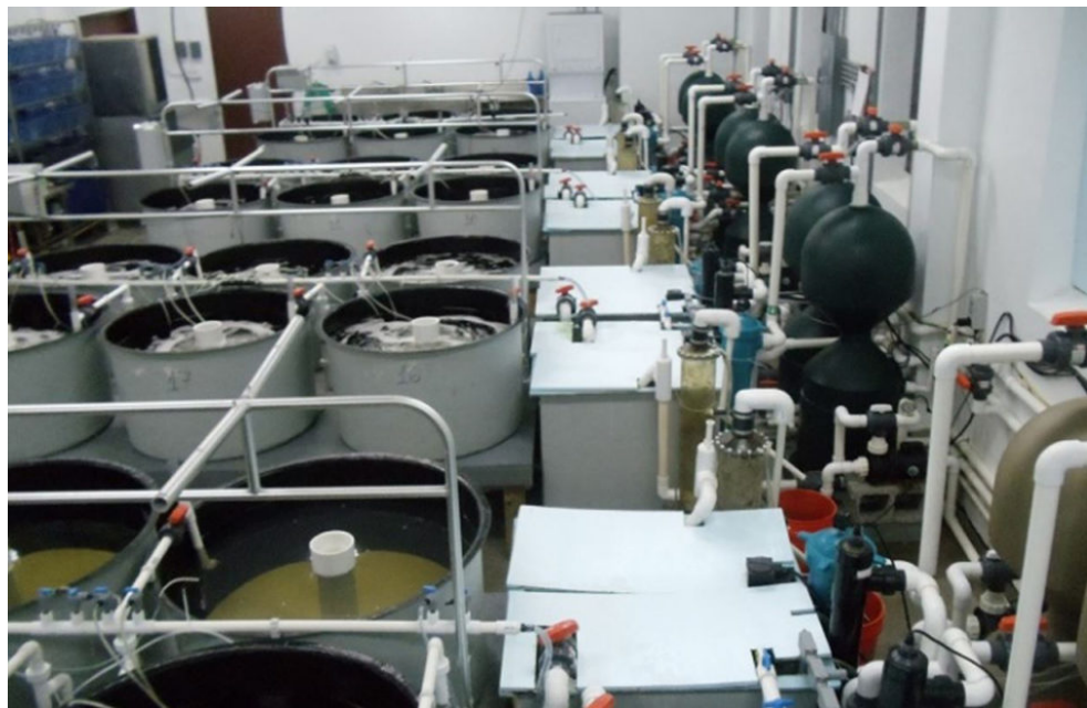
View of the experimental setup, with fish tanks and life-support systems.

For many years there has been interest in developing commercial culture of the Florida pompano ( Trachinotus carolinus ) a good candidate for intensive aquaculture. Its nutritional requirements have been studied for many years, but there are few published studies addressing lipid nutrition of Trachinotus spp. Although without definitive evidence, we assumed that Florida pompano – like other marine, carnivorous fish species – exhibit little to no capacity for LC-PUFA synthesis and must consume these critical nutrients directly. Recent findings suggest that LC-PUFA requirements may be satisfied more efficiently in the context of SFA- or MUFA-rich diets than C18 PUFA-rich diets. Consequently, we carried out a study to evaluate production performance and tissue composition of juvenile Florida pompano fed diets containing fish oil or 25:75 blends of fish oil and various other lipid sources. This article is adapted and summarized from Aquaculture 458(2016): 177–186.